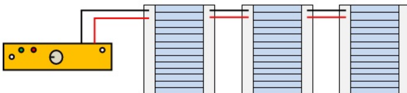
Figure 2. Frames connected parallel to pulse generator

The pulse generator is able to drive more than one collecting frame at the same time. The generator is able to drive up to 8-10 parallel connected frames with the surface of 600cm 2 each. The collection frames must be connected parallel to the pulse generator output as shown on the figure below: